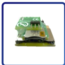
SD/ microSD Replacement Socket**