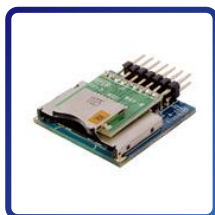
SD/ microSD Replacement Socket***