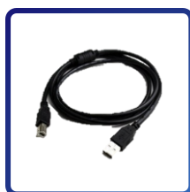
USB Cable for PC Link x 1