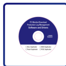
PC Link Software Disc x 1

*The SD slot rubber plug is specially designed for users when duplicate microSD cards.