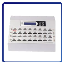
Duplicator x 1