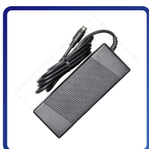
12V DC Adaptor x 1