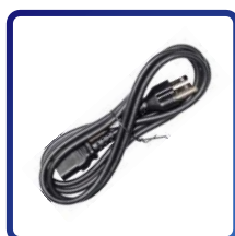
Power Cord x 1