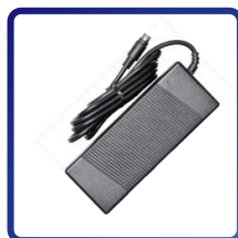
12V 9A Power Adapter