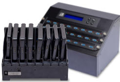
▲ Cooling brackets for external HDD/SSD

High speed transmission may cause storage media to generate heat during the process of duplication. It's advised to use cooling brackets for those storage media to stabilize the copy performance.